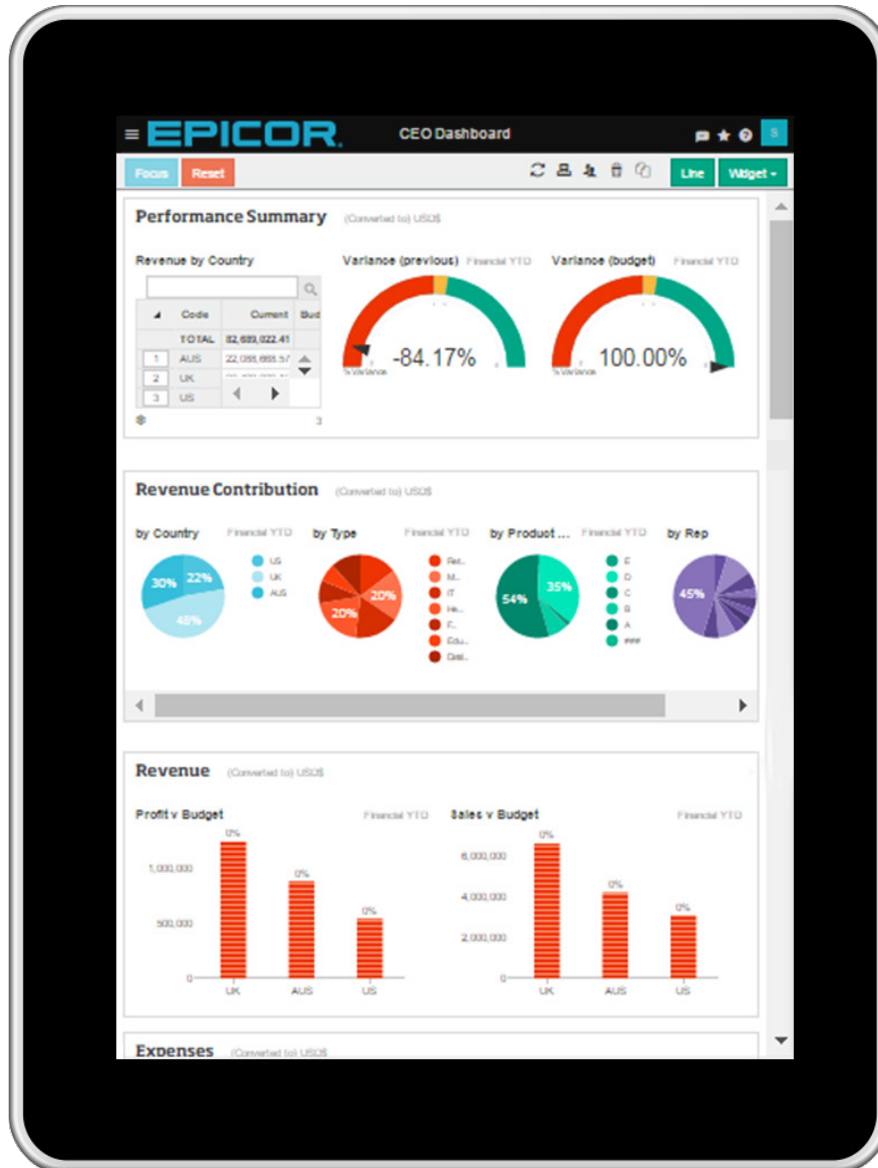
CEO dashboard shown on a mobile device

Manage your cash flow better by understanding what payables are coming due, are you making the most of vendor payment terms, and what payment discounts have been received over a selected time period.